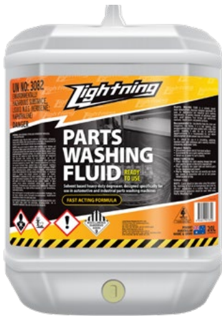
20L - LTPWF020