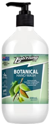
500mL - 063CBOT