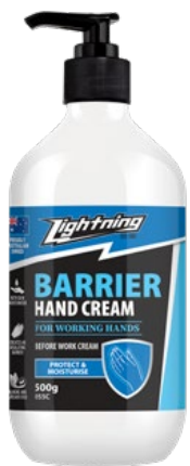
500mL - 055C