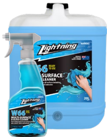
500mL - 066C