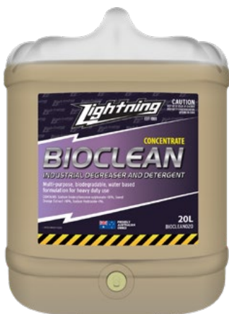
20L - BIOCLEAN020