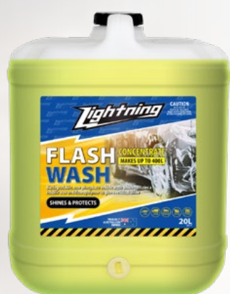
4L - 501N (Carton Qty: 4)