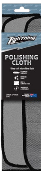
1 Pack - LTPC