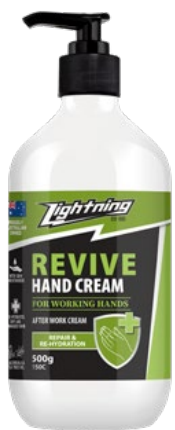
500mL - 150C