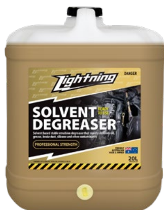
20L - MASD020