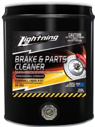
20L - MABAPC020