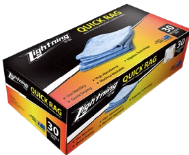
30 Pack - LQR030