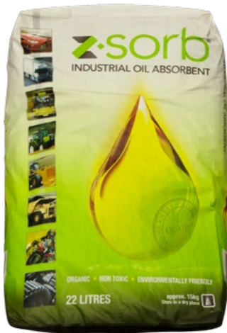
15Kg - ZSORB