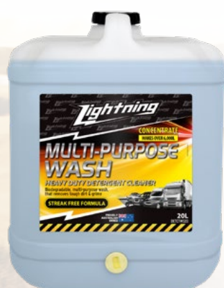
20L - DETCTW020