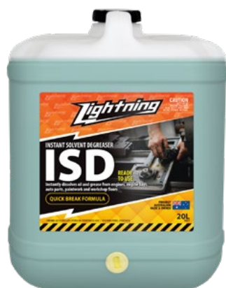
20L - 046T