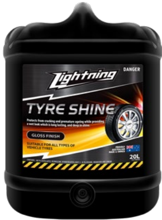
20L - CCTS020